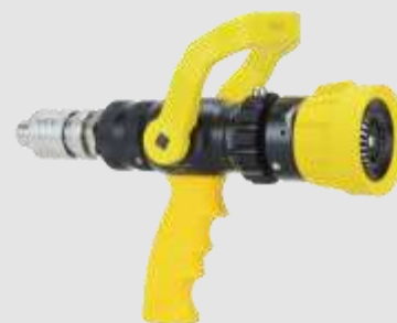
Attack 100-Pro Series Nozzle