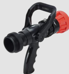
Attack 500-Pro Series Nozzle